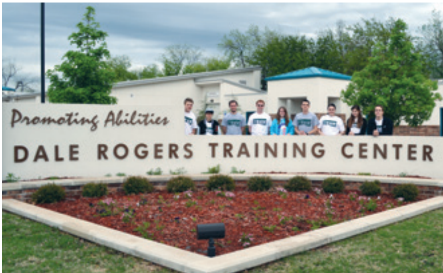
OU Volunteers at DRTC.