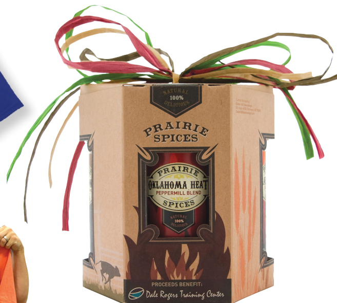
Spice Gift Sets