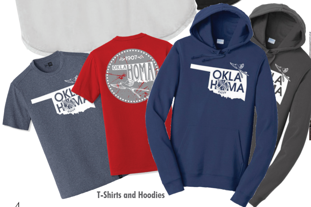
T-Shirts and Hoodies