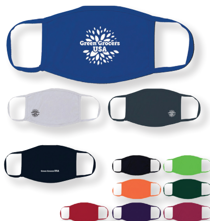
Wide Selection of Branded Facemasks

when you receive your order. This extra layer of inspection not only provides peace of mind, but it also provides jobs for hardworking Oklahomans. Email promosales@drtc.org