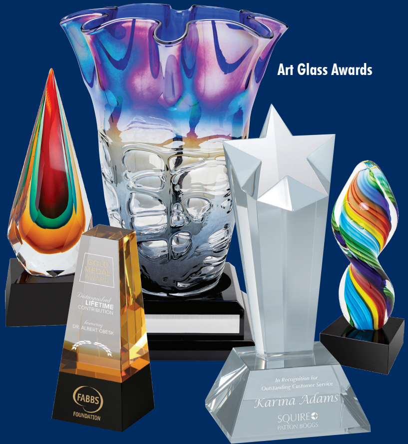
Art Glass Awards