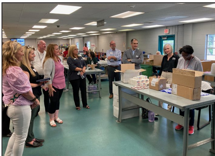
Guests at a previous Lunch and Learn tour