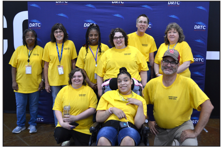
The ACT Committee at last year's party